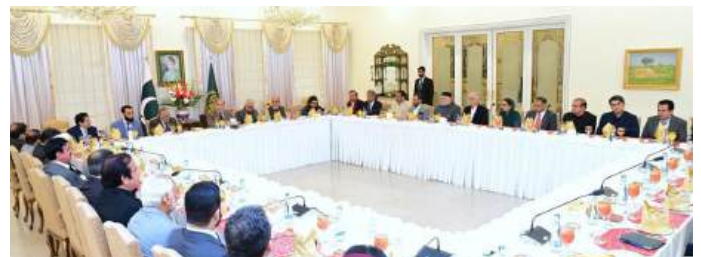
PRIME MINISTER MUHAMMAD SHEHBAZ SHARIF ADDRESSES A BREAKFAST SESSION WITH NEWLY INDUCTED MEMBERS OF THE FEDERAL CABINET, ISLAMABAD. 28 FEBRUARY 2025