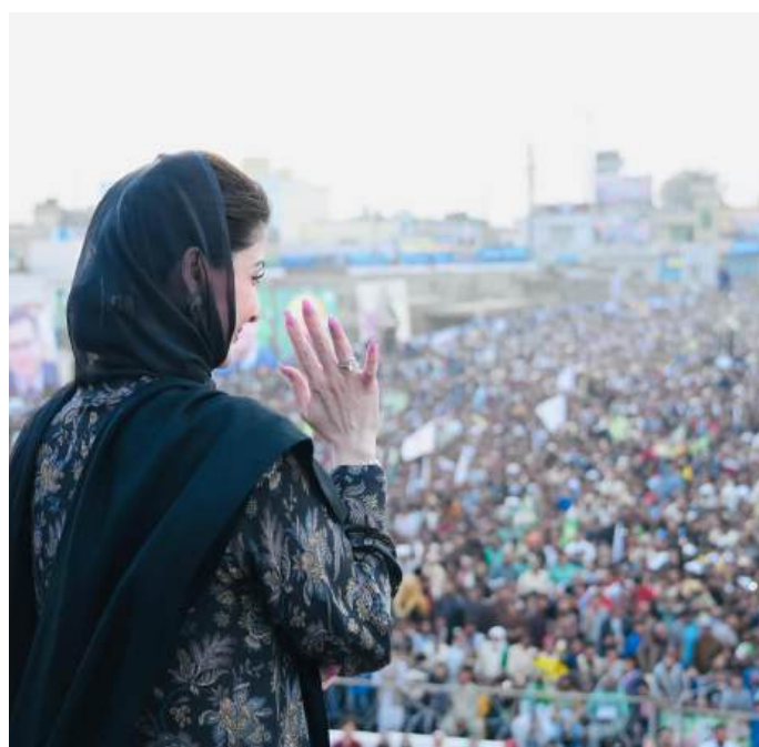
CHIEF MINISTER MARYAM NAWAZ WAVES TO CROWDS AT A PUBLIC RALLY IN NAROWAL. 18 FEBRUARY 2025