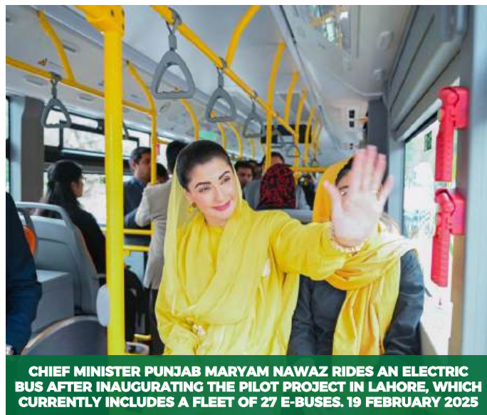
CHIEF MINISTER PUNJAB MARYAM NAWAZ RIDES AN ELECTRIC BUS AFTER INAUGURATING THE PILOT PROJECT IN LAHORE, WHICH CURRENTLY INCLUDES A FLEET OF 27 E-BUSES. 19 FEBRUARY 2025