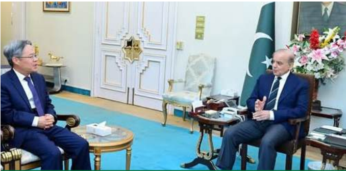
CHINA'S AMBASSADOR TO PAKISTAN JIANG ZAIDONG CALLS ON PRIME MINISTER MUHAMMAD SHEHBAZ SHARIF IN ISLAMABAD. 18 MARCH 2025