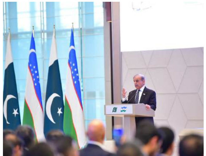
PRIME MINISTER MUHAMMAD SHEHBAZ SHARIF ADDRESSES THE PAKISTAN-UZBEKISTAN BUSINESS FORUM, TASHKENT. 26 FEBRUARY 2025