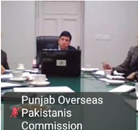
Punjab Overseas Pakistanis Commission