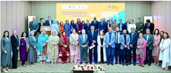
PRIME MINISTER MUHAMMAD SHEHBAZ SHARIF WITH THE PARTICIPANTS OF INTERNATIONAL WOMEN'S DAY CEREMONY, HELD AT THE PRIME MINISTER'S HOUSE IN ISLAMABAD. 8 MARCH 2025