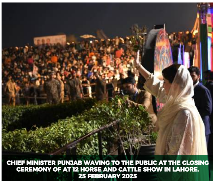
CHIEF MINISTER PUNJAB WAVING TO THE PUBLIC AT THE CLOSING CEREMONY OF AT 12 HORSE AND CATTLE SHOW IN LAHORE. 25 FEBRUARY 2025