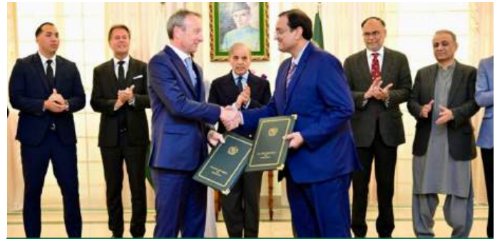
PRIME MINISTER MUHAMMAD SHEHBAZ SHARIF WITNESSES THE EXCHANGE OF AN MOU BETWEEN THE INTERNATIONAL FREE ZONES AUTHORITY OF UAE AND THE BOARD OF INVESTMENT OF PAKISTAN, ISLAMABAD. 5 MARCH 2025