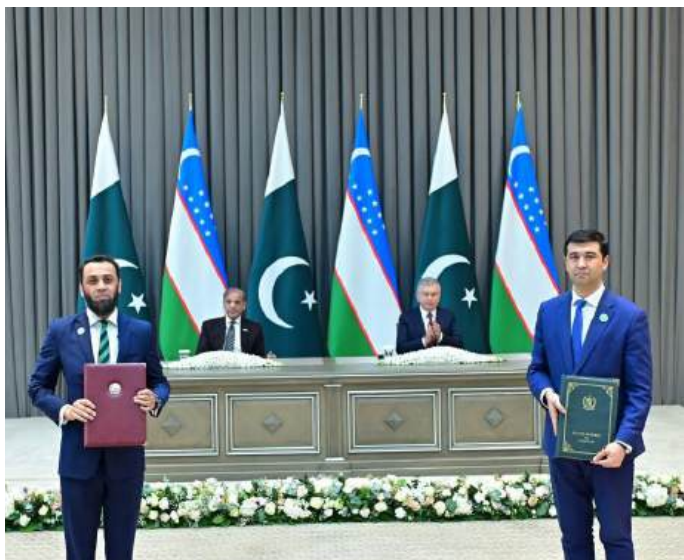
PRIME MINISTER MUHAMMAD SHEHBAZ SHARIF AND PRESIDENT OF UZBEKISTAN SHAVKAT MIRZIYOYEV WITNESS THE SIGNING OF MOUS AND AGREEMENTS BETWEEN THE TWO COUNTRIES IN TASHKENT. 26 FEBRUARY 2025