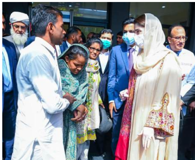
CHIEF MINISTER PUNJAB MARYAM NAWAZ LISTENS TO THE CONCERN OF PATIENTS, AND THEIR ATTENDANTS DURING A SURPRISE VISIT TO MAYOR HOSPITAL, LAHORE. 6 MARCH 2025