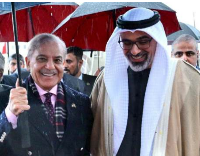
PRIME MINISTER MUHAMMAD SHEHBAZ SHARIF WELCOMES CROWN PRINCE OF ABU DHABI SHEIKH KHALID BIN MUHAMMAD BIN ZAYED AL NAHYAN AT NOOR KHAN BASE, ISLAMABAD. 27 FEBRUARY 2025