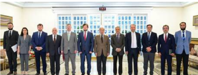
RUSSIAN FIRST DEPUTY MINISTER FOR ENERGY PAVEL SOROKIN CALLS ON PRIME MINISTER MUHAMMAD SHEHBAZ SHARIF IN ISLAMABAD. 28 FEBRUARY 2025