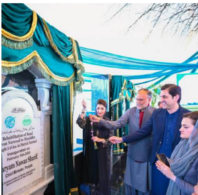
CHIEF MINISTER PUNJAB MARYAM NAWAZ INAUGURATES A ROAD INFRASTRUCTURE PROJECT IN NARWAL. 18 FEBRUARY 2025