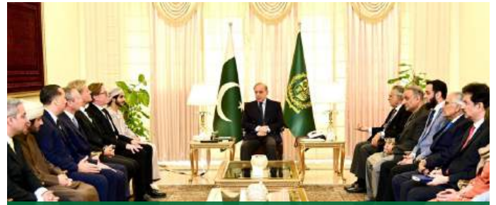
A DELEGATION OF AI-BASED PLATFORM ALERIA AND INTERNATIONAL FREE ZONES AUTHORITY UAE CALLED ON PRIME MINISTER MUHAMMAD SHEHBAZ SHARIF IN ISLAMABAD. 5 MARCH 2025