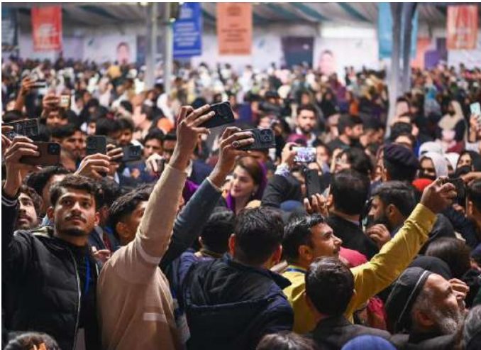
CHIEF MINISTER MARYAM NAWAZ DURING A VISIT TO BAHAWALPUR WHERE SHE DISTRIBUTED 3,011 HONHAAR SCHOLARSHIPS. 13 JANUARY 2025