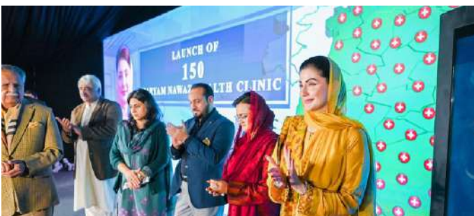
PUNJAB CHIEF MINISTER MARYAM NAWAZ SHARIF LAUNCHES PROJECT TO TRANSFORM 150 OF THE PROVINCE'S UNDERUTILISED BASIC HEALTH UNITS INTO "MARYAM NAWAZ HEALTH CLINICS". LAHORE. 08 JANUARY 2025