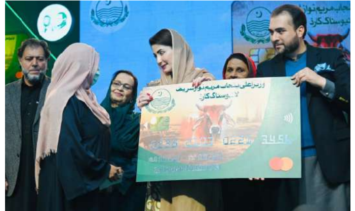
CHIEF MINISTER PUNJAB MARYAM NAWAZ SHARIF LAUNCHES PAKISTAN'S FIRST LIVESTOCK CARD. PAKPATTAN. 09 JANUARY 2025