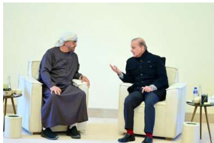
PRIME MINISTER MUHAMMAD SHEHBAZ SHARIF MEETS PRESIDENT OF THE UNITED ARAB EMIRATES, HIS HIGHNESS SHEIKH MOHAMED BIN ZAYED AL NAHYAN, TO STRENGTHEN BILATERAL TIES. RAHIM YAR KHAN. 05 JANUARY 2025