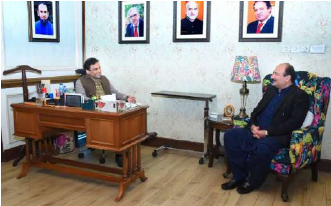
FORMER CHIEF MINISTER PUNJAB HAMZA SHAHBAZ IN A MEETING WITH CHAIRMAN PRIME MINISTER'S YOUTH PROGRAMME RANA MASHHOOD AHMAD KHAN. LAHORE. 26 DECEMBER 2024