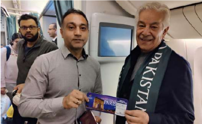
DEFENCE MINISTER KHAWAJA ASIF CELEBRATES THE RESUMPTION OF PIA'S FLIGHTS FROM ISLAMABAD TO PARIS. ISLAMABAD. 10 JANUARY 2025