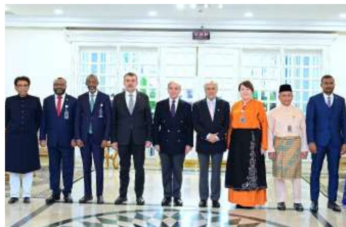
PRIME MINISTER MUHAMMAD SHEHBAZ SHARIF IN A GROUP PHOTO WITH THE MINISTERS OF EDUCATION PARTICIPATING IN THE INTERNATIONAL CONFERENCE ON GIRLS' EDUCATION. ISLAMABAD. 12 JANUARY 2025