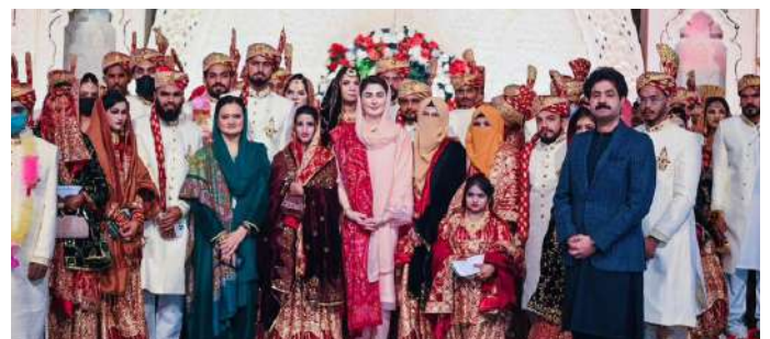
PUNJAB CHIEF MINISTER MARYAM NAWAZ LAUNCHES THE "PUNJAB DHEE RANI PROGRAMME" BY ATTENDING THE FIRST MASS WEDDING OF 51 COUPLES. LAHORE. 11 JANUARY 2025