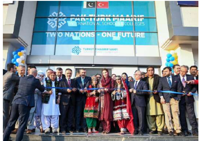
CHIEF MINISTER PUNJAB MARYAM NAWAZ SHARIF INAUGURATES PAK-TURK MAARIF INTERNATIONAL SCHOOL & COLLEGE. MULTAN. 10 JANUARY 2025