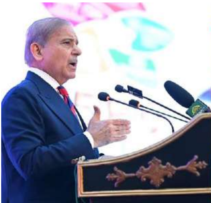
PRIME MINISTER SHEHBAZ SHARIF LAUNCHES 'URAAN PAKISTAN: HOMEGROWN NATIONAL ECONOMIC PLAN'. ISLAMABAD. 31 DECEMBER 2024