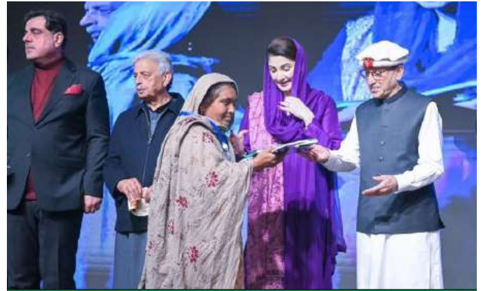
CHIEF MINISTER PUNJAB MARYAM NAWAZ SHARIF INAUGURATES ZAHRA HOMES/MASKAN RAVI SCHEME, ALLOTTING LETTERS AND KEYS OF HOUSES TO 100 FAMILIES. KALA SHAH KAKU. 13 JANUARY 2025