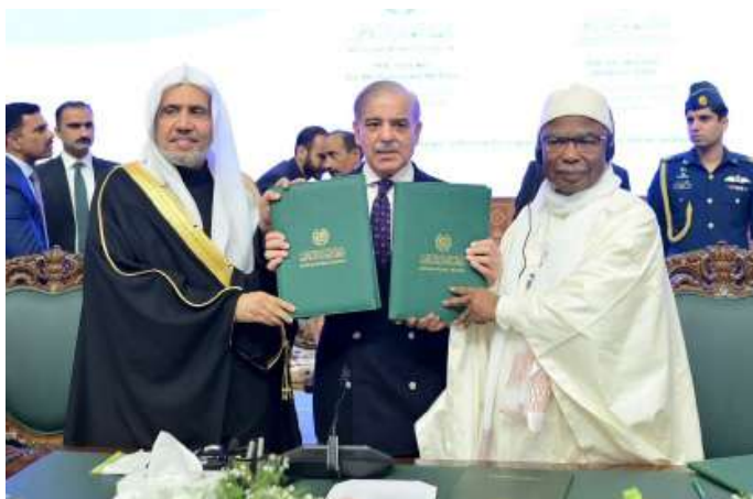
PRIME MINISTER MUHAMMAD SHEHBAZ SHARIF WITNESSES THE EXCHANGE OF MOUs BETWEEN MUSLIM WORLD LEAGUE AND OIC, AT THE INTERNATIONAL CONFERENCE ON GIRLS' EDUCATION. ISLAMABAD. 11 JANUARY 2025