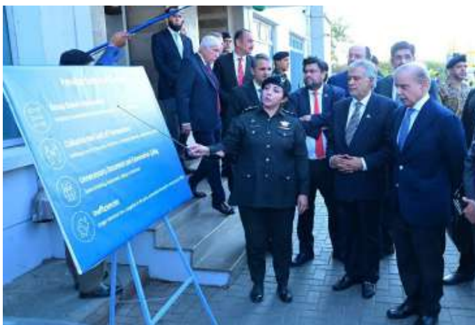
PRIME MINISTER MUHAMMAD SHEHBAZ SHARIF INAUGURATES FACELESS CUSTOMS ASSESSMENT SYSTEM OF THE FEDERAL BOARD OF REVENUE (FBR). KARACHI. 08 JANUARY 2025