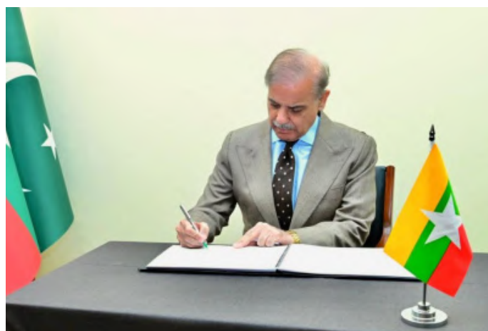
PRIME MINISTER MUHAMMAD SHEHBAZ SHARIF VISITS THE EMBASSY OF MYANMAR IN ISLAMABAD TO OFFER CONDOLENCES OVER THE LOSS OF LIVES AND DESTRUCTION CAUSED BY THE EARTHQUAKE. 4 APRIL 2025