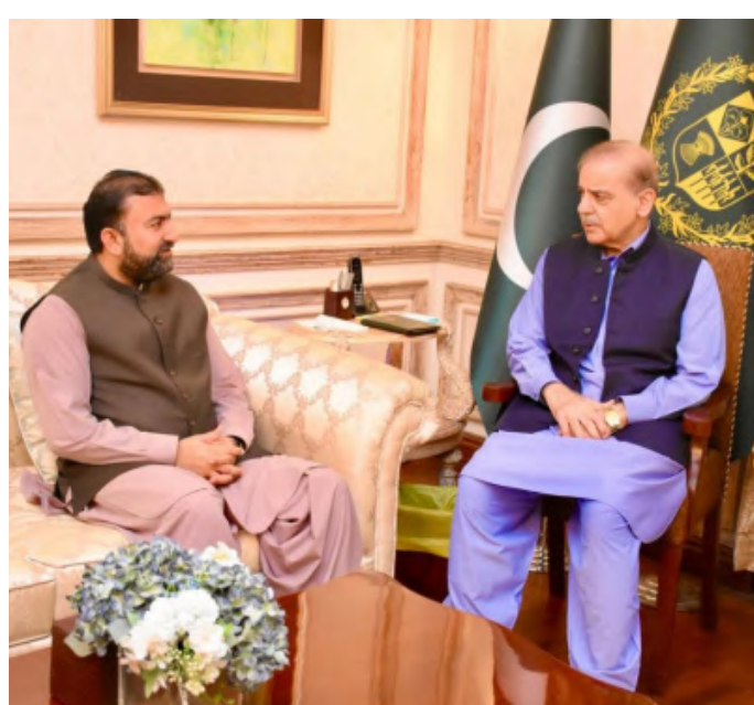
PRIME MINISTER MUHAMMAD SHEHBAZ SHARIF MEETS CHIEF MINISTER OF BALUCHISTAN SARFRAZ BUGTI IN ISLAMABAD TO DISCUSS ECONOMIC, SOCIAL, AND LAW AND ORDER ISSUES, ALONG WITH DEVELOPMENT PROJECTS SUPPORTED BY THE FEDERAL GOVERNMENT. 2 APRIL 2025