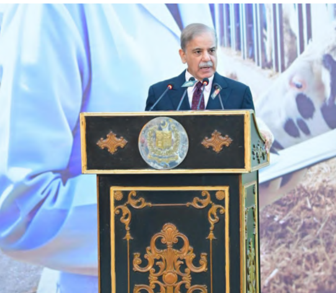
PRIME MINISTER MUHAMMAD SHEHBAZ SHARIF ADDRESSES A CEREMONY TO SEND 1,000 AGRICULTURE GRADUATES TO CHINA FOR TRAINING IN THE AGRICULTURAL SECTOR, ISLAMABAD. 16 APRIL 2025