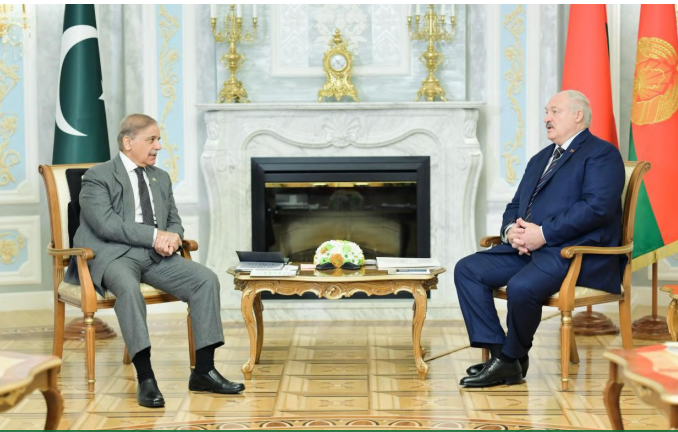
PRIME MINISTER MUHAMMAD SHEHBAZ SHARIF WITH BALARUS PRESIDENT ALEKSANDR LUKASHENKO DURING A TWO-DAY OFFICIAL VISIT TO BELARUS. MINSK. 12 APRIL 2025