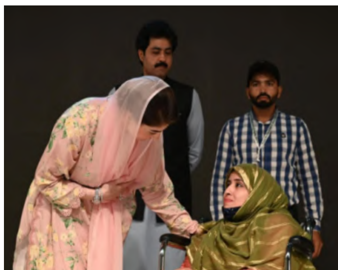
CHIEF MINISTER PUNJAB MARYAM NAWAZ SHARIF INTERACTS WITH A WOMAN IN WHEELCHAIR DURING THE LAUNCH OF THE ASSISTIVE DEVICES PROGRAMME IN LAHORE. 17 APRIL 2025