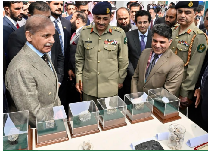
PRIME MINISTER MUHAMMAD SHEHBAZ SHARIF VISITS EXHIBITION STALLS WITH CHIEF OF ARMY STAFF GENERAL ASIM MUNIR AT THE PAKISTAN MINERALS INVESTMENT FORUM 2025, ISLAMABAD. 8 APRIL 2025