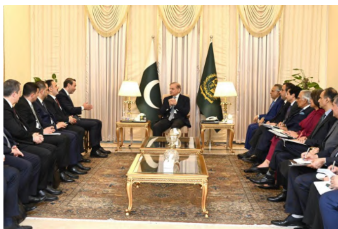
PRIME MINISTER MUHAMMAD SHEHBAZ SHARIF MEETS WITH TURKISH MINISTER OF ENERGY AND NATURAL RESOURCES ALPARSLAN BAYRAKTAR IN ISLAMABAD. 8 APRIL 2025