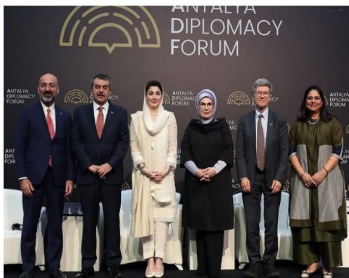
CHIEF MINISTER PUNJAB MARYAM NAWAZ PARTICIPATES IN A PANEL DISCUSSION AT THE ANTALYA DIPLOMACY FORUM 2025, ALONGSIDE GLOBAL LEADERS AND EXPERTS. ANTALYA. 12 APRIL 2025