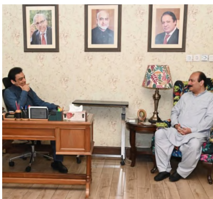
CHAIRMAN PRIME MINISTER'S YOUTH PROGRAMME RANA MASHHOOD AHMED KHAN MEETS FORMER PUNJAB CHIEF MINISTER HAMZA SHAHBAZ SHARIF IN LAHORE TO DISCUSS YOUTH DEVELOPMENT INITIATIVES AND THE NATIONAL POLITICAL LANDSCAPE. 16 APRIL 2025