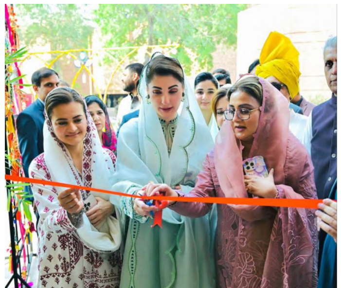
CHIEF MINISTER PUNJAB MARYAM NAWAZ INAUGURATES THE PUNJAB CULTURE DAY CELEBRATIONS, HIGHLIGHTING THE VIBRANT CULTURAL IDENTITY OF THE PROVINCE. 18 APRIL 2025