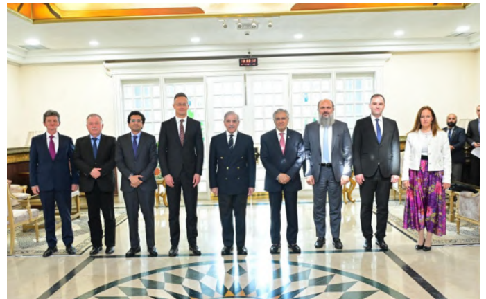
FOREIGN MINISTER OF HUNGARY PÉTER SZIJJÁRTÓ CALLS ON PRIME MINISTER MUHAMMAD SHEHBAZ SHARIF DURING HIS OFFICIAL VISIT TO PAKISTAN. 17 APRIL 2025