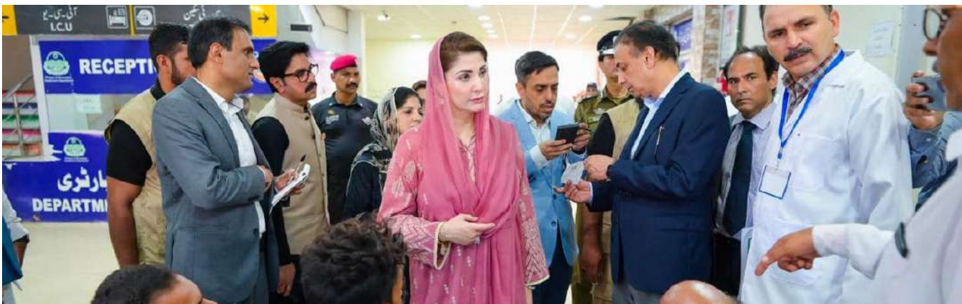
CHIEF MINISTER MARYAM NAWAZ VISITS MIANWALI DISTRICT HEADQUARTERS HOSPITAL AND INSPECTED VARIOUS WARDS. 08 AUGUST 2024