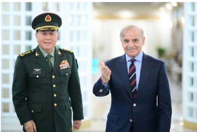
COMMANDER OF THE GROUND FORCES OF THE PEOPLE'S LIBERATION ARMY OF CHINA, GENERAL LI QIAOMING CALLS ON PRIME MINISTER MUHAMMAD SHEHBAZ SHARIF. ISLAMABAD. 26 AUGUST 2024