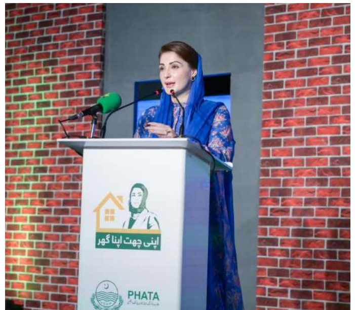
PUNJAB CHIEF MINISTER MARYAM NAWAZ ADDRESSING THE LAUNCHING CEREMONY OF "APNI CHAT APNA GHAR" PROGRAMME IN LAHORE. 21 AUGUST 2024