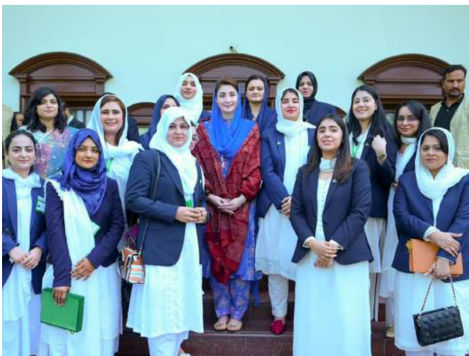
A DELEGATION OF OFFICERS OF THE 7TH CIVIL SERVICE TRAINING PROGRAMME OF SINDH MET WITH CHIEF MINISTER MARYAM NAWAZ IN LAHORE. 21 AUGUST 2024