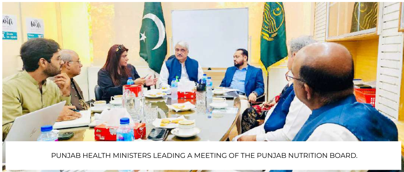
PUNJAB HEALTH MINISTERS LEADING A MEETING OF THE PUNJAB NUTRITION BOARD.

“ ACCORDING TO THE 2015 GLOBAL NUTRITION REPORT, EVERY US $1 SPENT ON NUTRITION GIVES A US $16 RETURN. ”