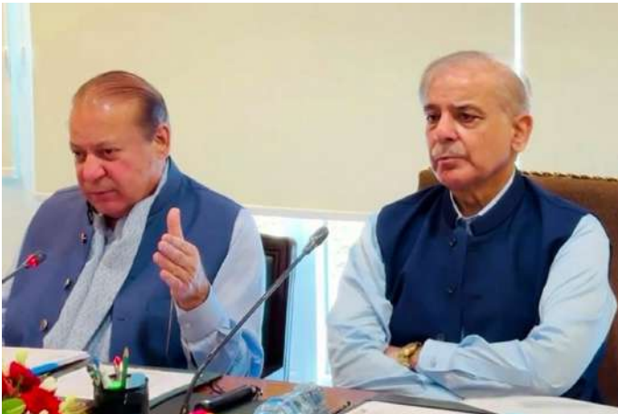
PML-N PRESIDENT NAWAZ SHARIF SPEAKS TO PARTY MEN DURING A MEETING AT MODEL TOWN SECRETARIAT IN LAHORE. 15 AUGUST 2024