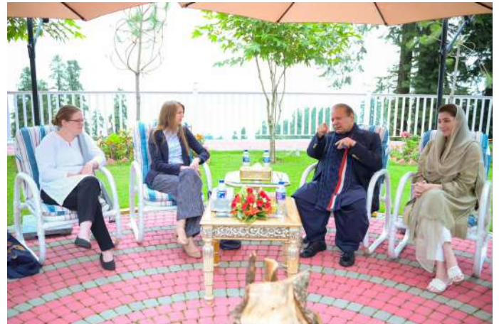
BRITISH HIGH COMMISSIONER JANE MARRIOTT CALLED ON PML-N PRESIDENT MIAN NAWAZ SHARIF AND PUNJAB CHIEF MINISTER MARYAM NAWAZ IN MURREE. 18 AUGUST 2024