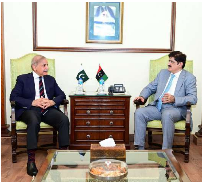
PRIME MINISTER MUHAMMAD SHEHBAZ SHARIF MEETS CHIEF MINISTER SINDH SYED MURAD ALI SHAH IN KARACHI. 9 AUGUST 2024