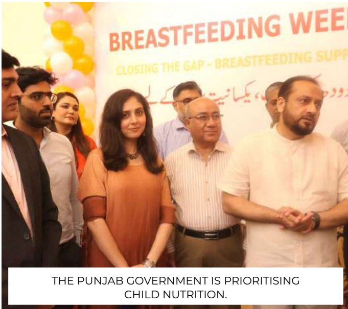
THE PUNJAB GOVERNMENT IS PRIORITISING CHILD NUTRITION.

to-use therapeutic foods (RUTF) and developing local alternatives through research and development. It also seeks to recommend legislation for the fortification of essential staple foods and ensure food safety in collaboration with the Punjab Food Authority.