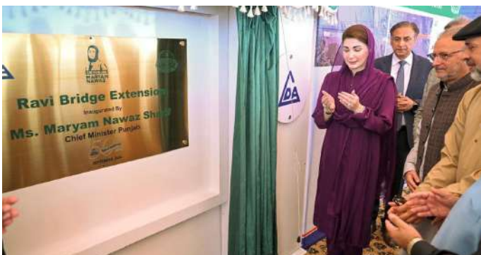
CHIEF MINISTER PUNJAB MARYAM NAWAZ PRAYS AT THE INAUGURATION CEREMONY OF THE CONTROLLED ACCESS CORRIDOR ON BUND ROAD. LAHORE. 04 SEPTEMBER 2024