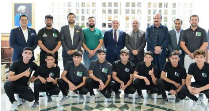
THE PAKISTAN STREET CHILD FOOTBALL TEAM THAT REPRESENTED PAKISTAN IN THE NORWAY CUP 2024, U17 CATEGORY, CALLS ON PRIME MINISTER MUHAMMAD SHEHBAZ SHARIF. ISLAMABAD. 11 SEPTEMBER 2024