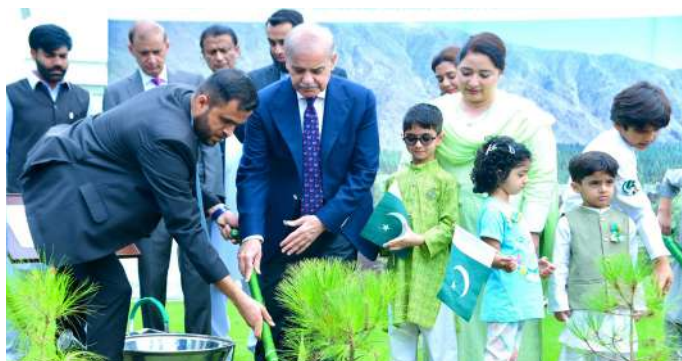
PRIME MINISTER MUHAMMAD SHEHBAZ SHARIF PLANTS A SAPLING TO LAUNCH THE 'MONSOON TREE PLANTATION CAMPAIGN 2024. ISLAMABAD. 07 AUGUST 2024