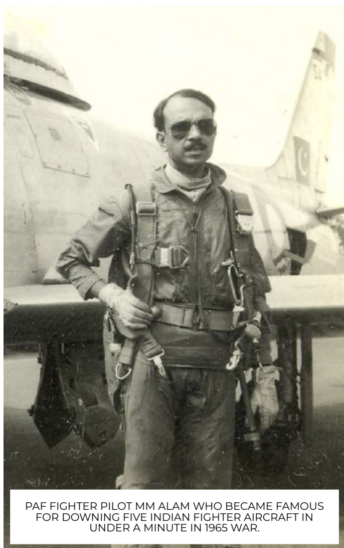
PAF FIGHTER PILOT MM ALAM WHO BECAME FAMOUS FOR DOWNING FIVE INDIAN FIGHTER AIRCRAFT IN UNDER A MINUTE IN 1965 WAR.

PEARSON READY TO MEDIATE IN KASHMIR Canada informs UN