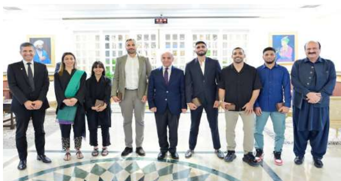
A DELEGATION OF THE MIXED MARTIAL ARTS FEDERATION CALLS ON PRIME MINISTER MUHAMMAD SHEHBAZ SHARIF. ISLAMABAD. 11 SEPTEMBER 2024