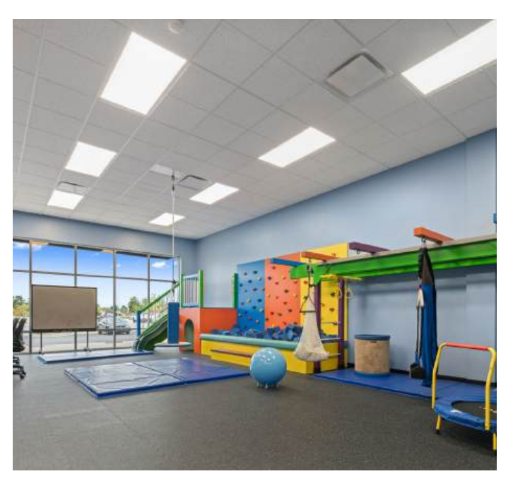
FIRST PUBLIC AUTISM SCHOOL

Education remains a cornerstone of the Punjab Government's public service agenda. Punjab's Honhaar Scholarship Programme provides full tuition fees to eligible students in public sector universities and colleges. The government has expanded the programme to cover more than 30,000 students annually, with an investment of over PKR 7 billion this year alone. This initiative will support 120,000 students in the upcoming four years, with a total commitment of over PKR 130 billion over the next eight years. For the first time, this scholarship will also cover private sector universities such as LUMS and the University of Lahore.