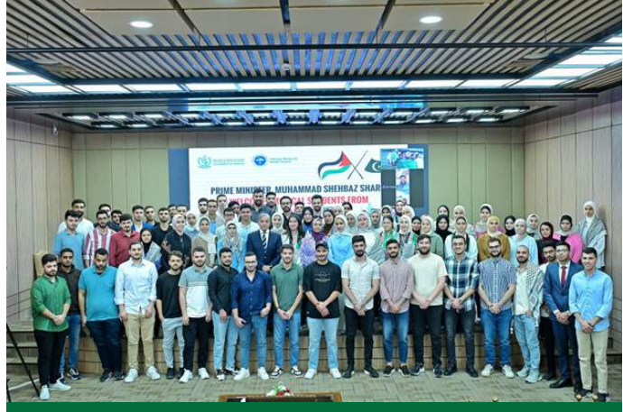
PRIME MINISTER MUHAMMAD SHEHBAZ SHARIF IN A GROUP PHOTO WITH PALESTINIAN STUDENTS WHO RECENTLY ARRIVED IN PAKISTAN TO COMPLETE THEIR MEDICAL EDUCATION. ISLAMABAD. 23 OCTOBER 2024