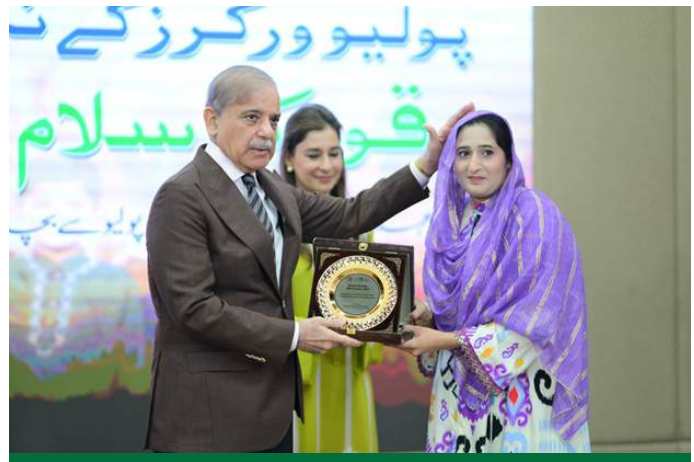
PRIME MINISTER MUHAMMAD SHEHBAZ SHARIF PRESENTS SOUVENIRS TO FRONT LINE POLIO WORKERS AND THE RELATIVES OF THOSE WHO DIED IN THE LINE OF DUTY. ISLAMABAD. 24 OCTOBER 2024