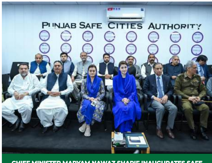
CHIEF MINISTER MARYAM NAWAZ SHARIF INAUGURATES SAFE CITY PROJECT IN SHEIKHPURA. 24 OCTOBER 2024