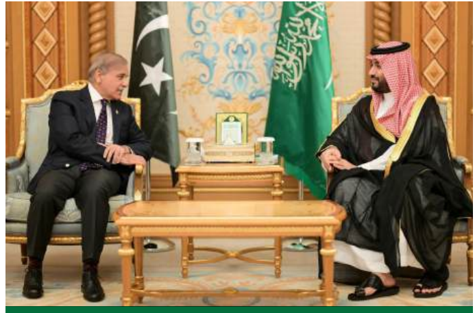
PRIME MINISTER MUHAMMAD SHEHBAZ SHARIF MET THE CROWN PRINCE AND PRIME MINISTER OF SAUDI ARABIA HIS ROYAL HIGHNESS MOHAMMED BIN SALMAN ON THE SIDELINES OF FUTURE INVESTMENT INITIATIVE FORUM. RIYADH. 29 OCTOBER 2024