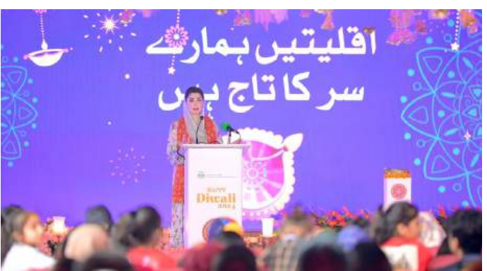
PUNJAB CHIEF MINISTER MARYAM NAWAZ SHARIF ADDRESSING THE DIWALI CEREMONY. LAHORE. 30 OCTOBER 2024