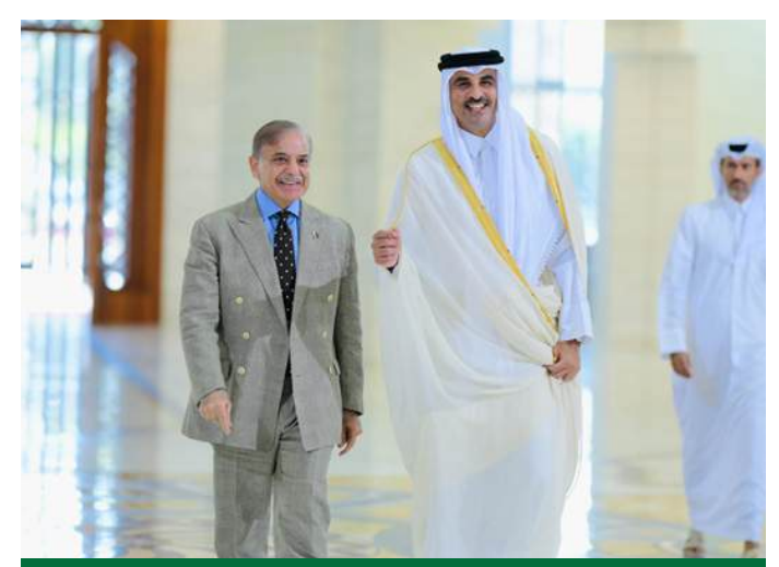
PRIME MINISTER MUHAMMAD SHEHBAZ SHARIF MEETS AMIR OF QATAR SHEIKH TAMIM BIN HAMAD AL THANI. DOHA. 31 OCTOBER 2024