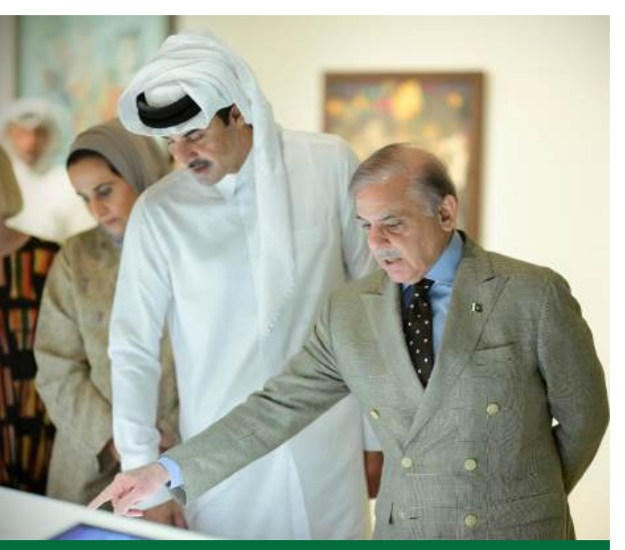
PRIME MINISTER MUHAMMAD SHEHBAZ SHARIF, AMIR OF QATAR SHIEKH TAMIM BIN HAMAD AL-THANI AND CHAIRPERSON OF QATAR MUSEUMS, SHEIKHA AL-MAYASSA BINT HAMAD AL-THANI, VISIT AN EXHIBITION OF PAKISTANI ARTWORKS IN THE NATIONAL MUSEUM OF QATAR. DOHA. 31 OCTOBER 2024