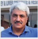
Khawaja Salman Rafique, Member Punjab Assembly/ Ex Minister (Provincial) Specialized Healthcare.

An estimated 40% of all the diseases reported in Pakistan are linked to kidney, bladder and urinary tract, and liver malfunction. Before the inception of the Pakistan Kidney and Liver Institute (PKLI) and Research Center, affluent patients used to travel to India and China for liver and kidney transplant while the poor had no option but to succumb to the pain and agony.